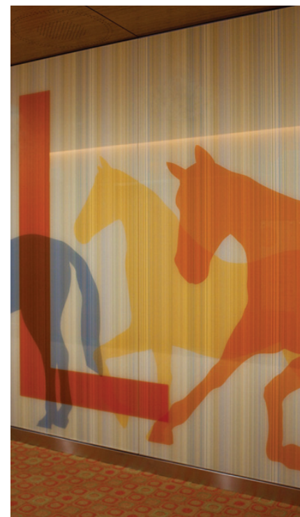
Randall Children's Hospital at Legacy Emanuel by ZGF Architects