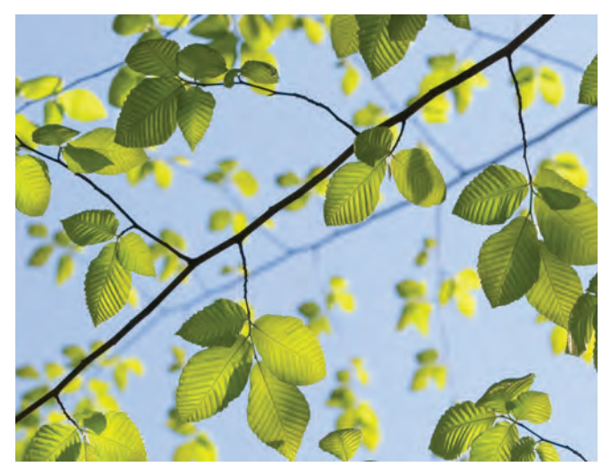
Top Original Photo "Beech Leaves" by Henry Domke

Skyline Design worked closely with Perkins Eastman to adapt and enlarge the artwork to the expansive glass curtain wall until the pattern treatment suited the different requirements of the interior and exterior spaces. Skyline Design's Eco-etch® technique creates a tailored, etched pattern on a clear glass field allowing plenty of daylight to fill the interior while simultaneously camouflaging views of the center's parking lot for a light-filled clean look that balances privacy.