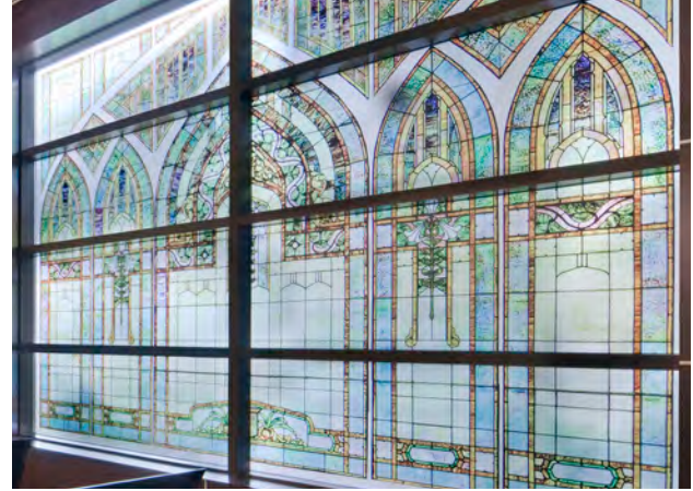
Skyline Design Shop Drawing